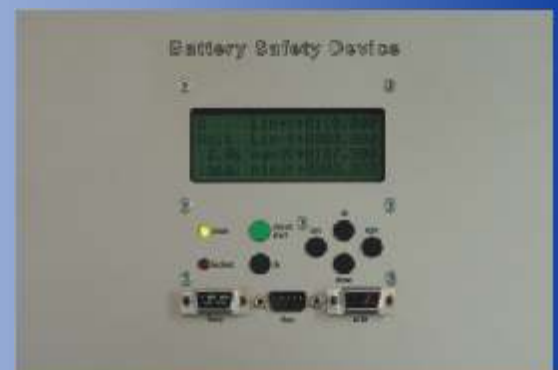
Battery Safety Device