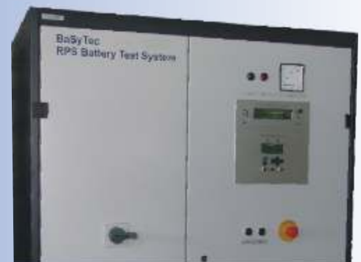
RPS Battery Test System

The RPS system is optimized for high power and high energy automotive systems, like HEV, PHEV, EV and SLI batteries and dlc.